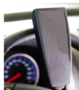
Wireless transmission RPM & temp probes.