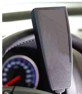
Wireless transmission EOBD scan tool.