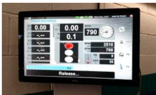
Large touch-screen display.